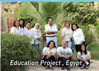
Education Project , Egypt