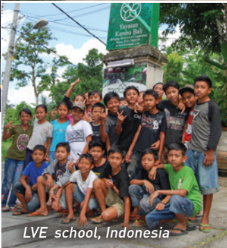
LVE school, Indonesia