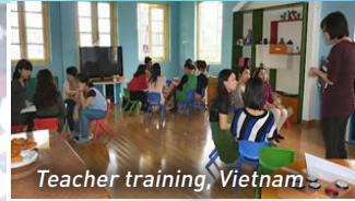
Teacher training, Vietnam