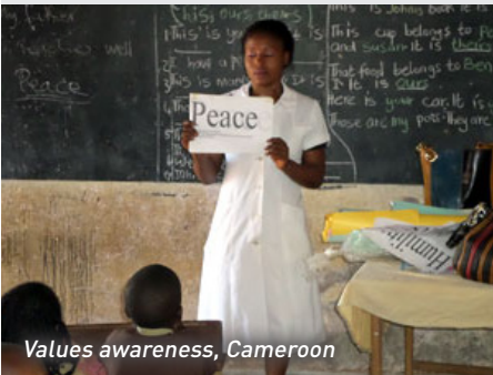
Values awareness, Cameroon