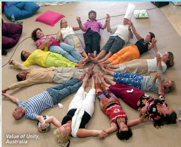
Value of Unity, Australia