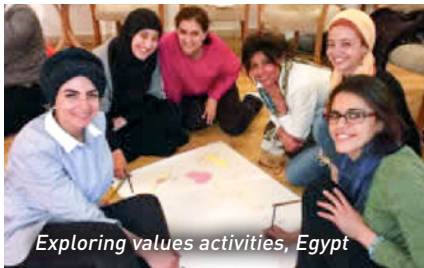
Exploring values activities, Egypt

As well as guidance for parents and caregivers as they explore and reflect on their own values, there are also ideas for values activities that parents can carry out as a group and work with at home.