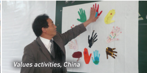
Values activities, China