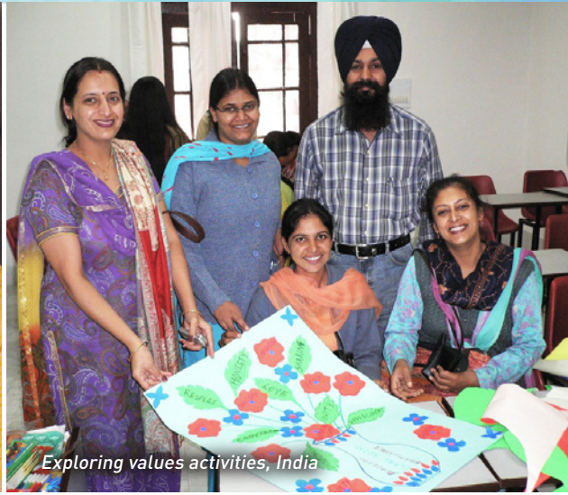
Exploring values activities, India