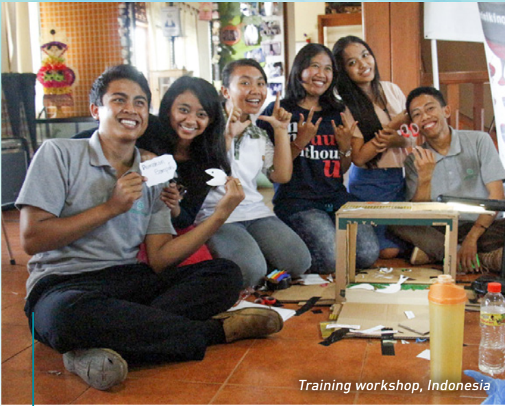
Training workshop, Indonesia