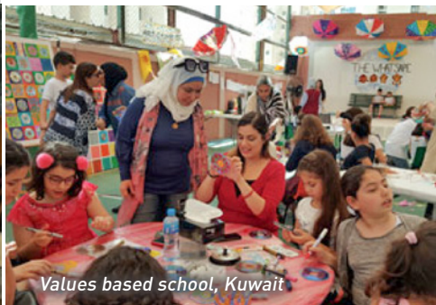
Values based school, Kuwait