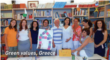
Green values, Greece

When LVE is implemented in schools, this evidence-based educational innovation results in positive and supportive school climates, caring and respectful relationships between educators and students, and higher academic outcomes. Students of all ages enjoy and learn from a variety of values activities and develop social and emotional skills, including conflict resolution, that enable them to live their values. In schools where LVE is fully implemented, there is no bullying.