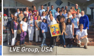
LVE Group, USA