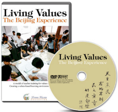
A variety of LVE resources available in different languages