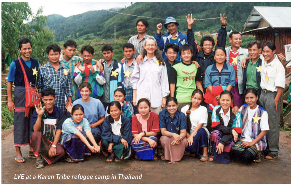
LVE at a Karen Tribe refugee camp in Thailand

Learning about and experiencing values helps students develop respect for each and every person and make socially-conscious choices and there is clear evidence to indicate that students thrive, both personally and academically, in a values-based atmosphere, a supportive, safe environment of mutual respect and care. At its best, values education may thus be seen as a way of being, grounded in both head and heart, in which values are modelled and lived and so taught by example.