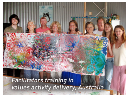
Facilitators training in values activity delivery, Australia

environment is encouraged. A separate book, Living Green Values , and two related publications, offer materials for different age groups to help develop awareness of the importance of taking care of the Earth and her resources and living sustainably.