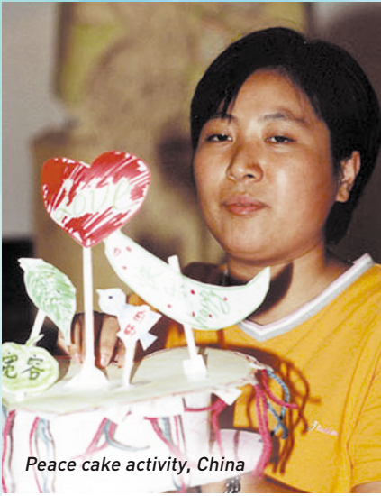
Peace cake activity, China