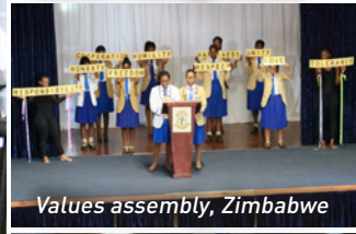
Values assembly, Zimbabwe