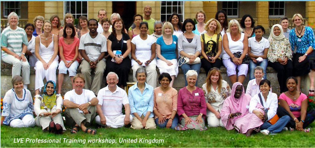
LVE Professional Training workshop, United Kingdom